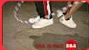
BACK TO BACK