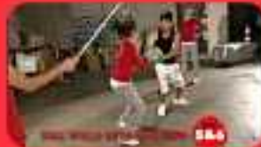
BALL SKILLS WITH