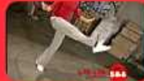
CAN CAN SLOWER