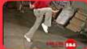
CAN CAN DOUBLE